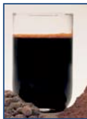
Fig Balsamic Vinegar

Aromatic fig vinegar with sweet-tart flavor.